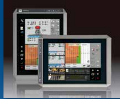
Certified virtual ISOBUS terminal. Sense touch series.