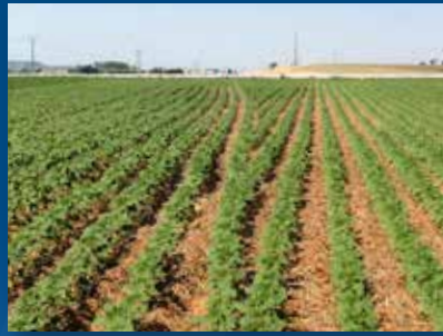
Section control row by row.