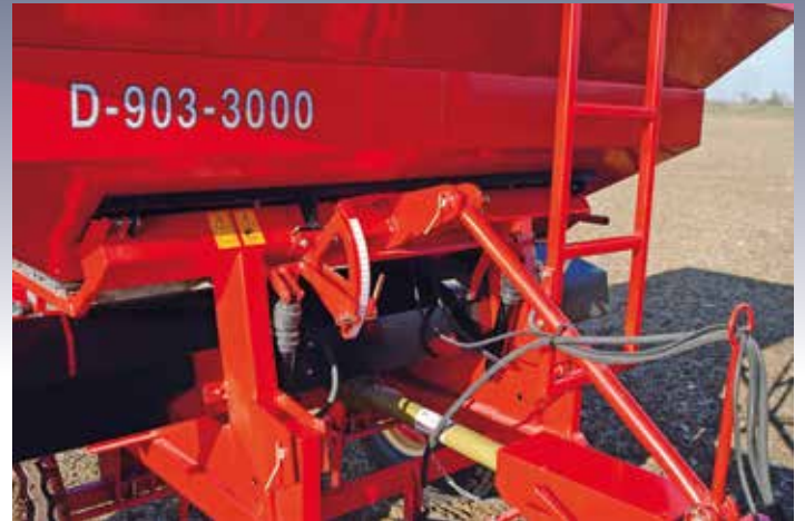
Hydraulic opening-closing drive.