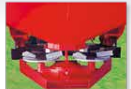
SOLA special gearbox.