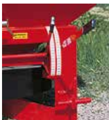
Mechanic opening-closing drive.