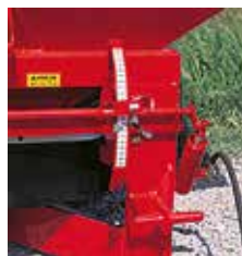
Hydraulic opening-closing drive.