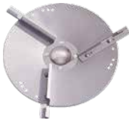
Stainless Steel disc for 36m.