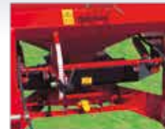
Hydraulic opening-closing drive.