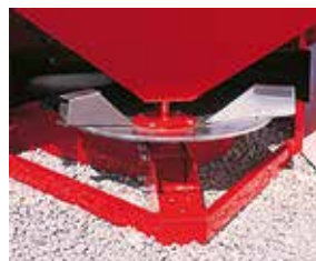
Stainless Steel spreading disc.