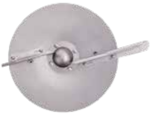
Stainless Steel disc for 24m.