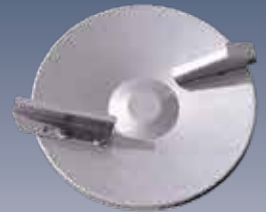
Stainless steel disc.