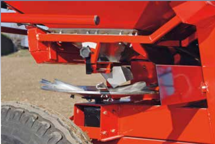
Fertilize drop control.